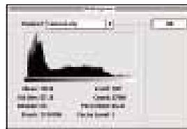
An underexposed image has extreme peaks on one side of the histogram.

I guess you'll have realized by now that I'm a fan of automatic exposure, providing that you review your pictures on the LCD screen on the back of your digital camera as you shoot. If you are a newcomer to photography, there are many other different aspects that have to be considered before you take each picture. How do I frame the