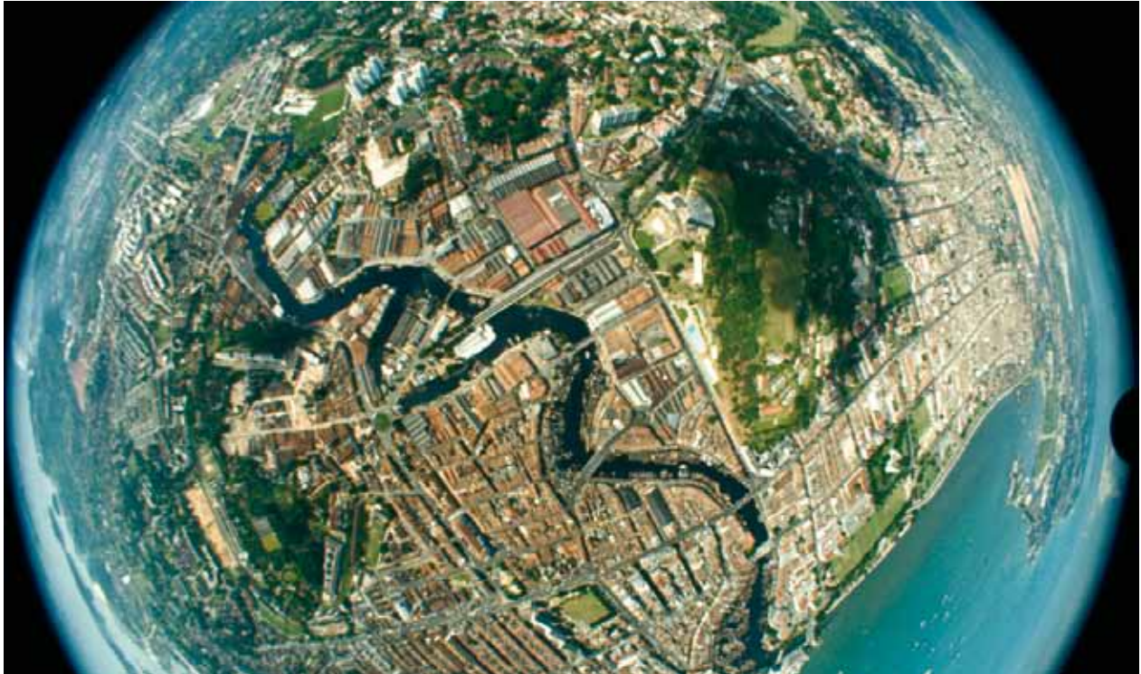
A fisheye lens can offer a chance to make unusual images.

a standard lens. This effect can be used to “drop out” or blur backgrounds to create a sharp, clear subject without the confusion of a busy background.