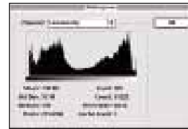
An overexposed image appears as a valley in the histogram.