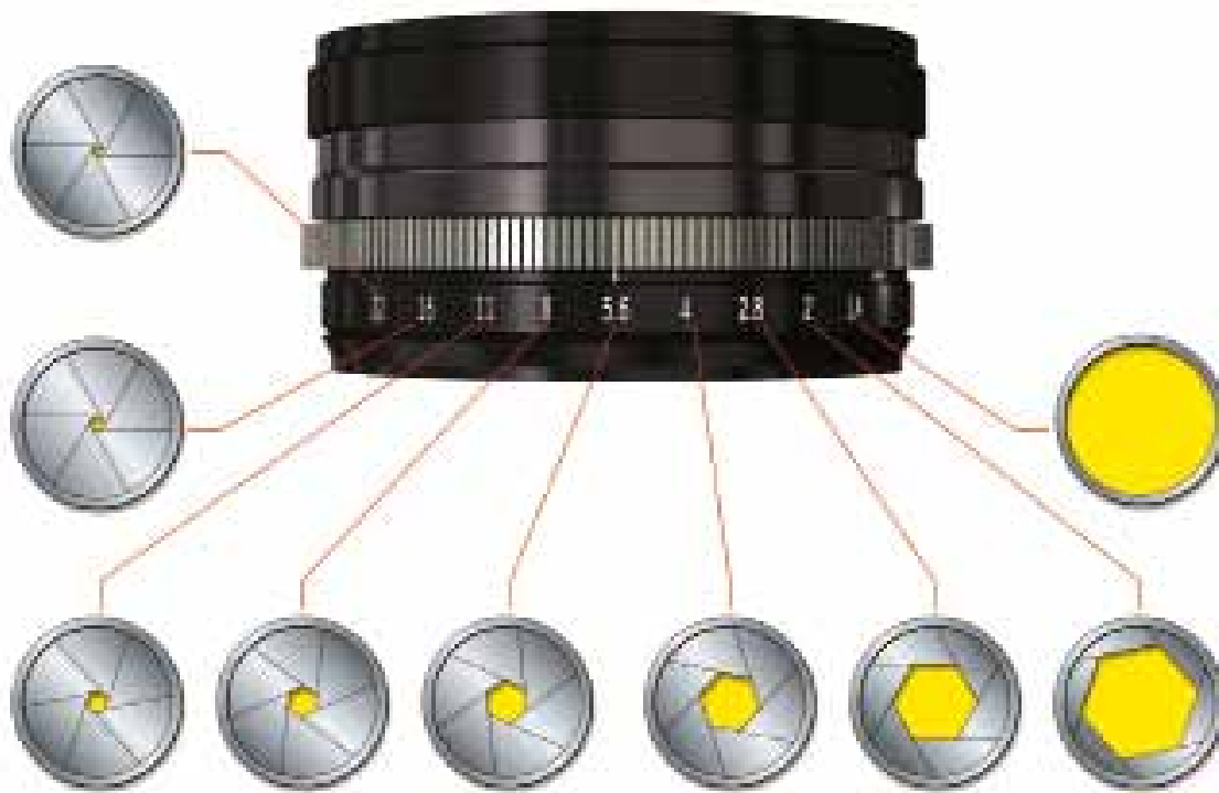
In the diagram below, each combination of lens aperture and shutter speed produces the same exposure, or lets the same amount of light into the camera.

the correct exposure. This can be especially useful when you're shooting action pictures and you want to freeze the motion by setting a high shutter speed. By the same token, if you were photographing a waterfall and you wanted the water to blur, you could set a slow shutter speed and the aperture would adjust accordingly. It goes without saying that both modes assume you have enough light to expose your pictures within the range of shutter speeds and apertures you're using.